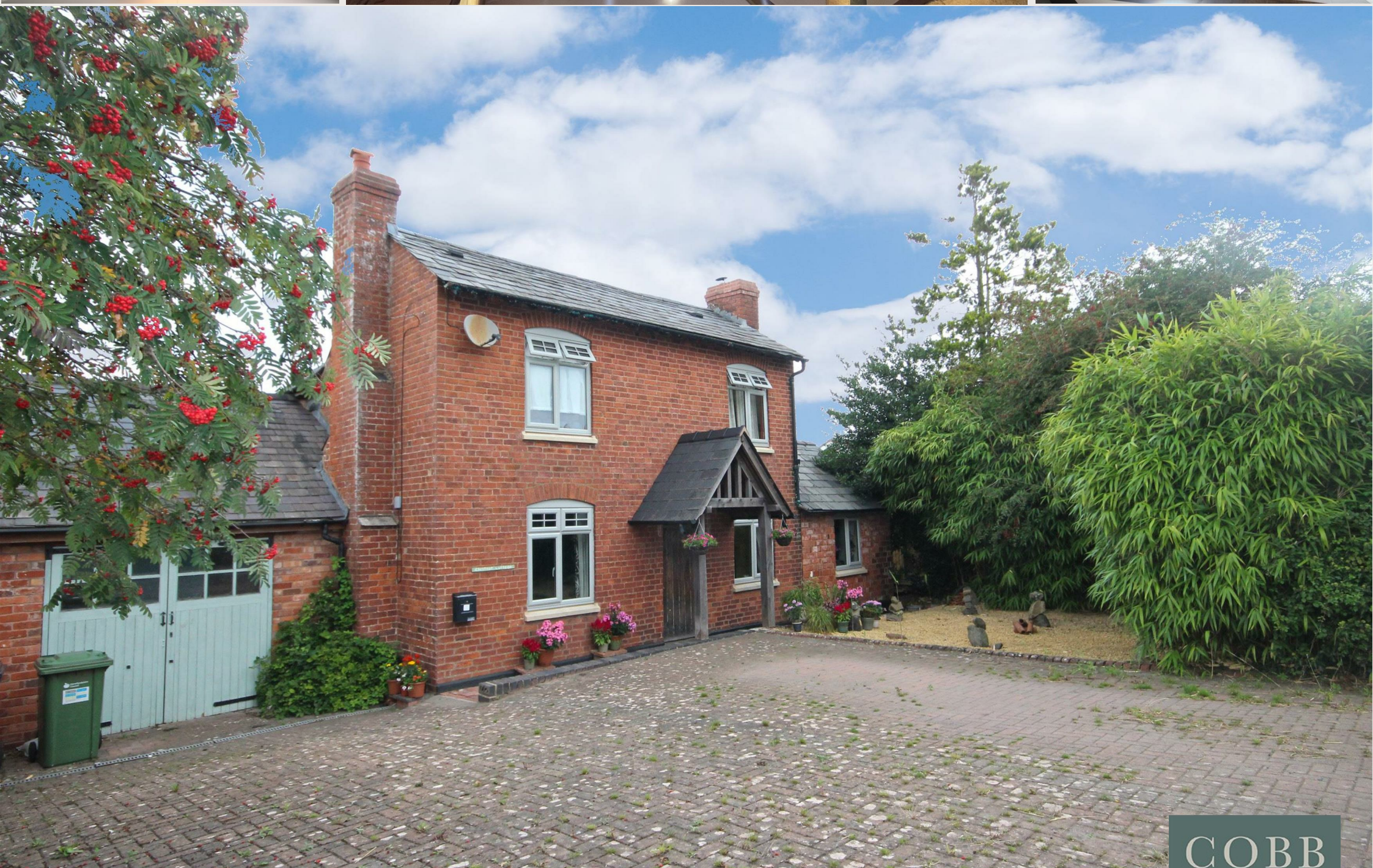
Chestnut Cottage, Burley Gate, Hereford, HR1 3QR Price £410,000